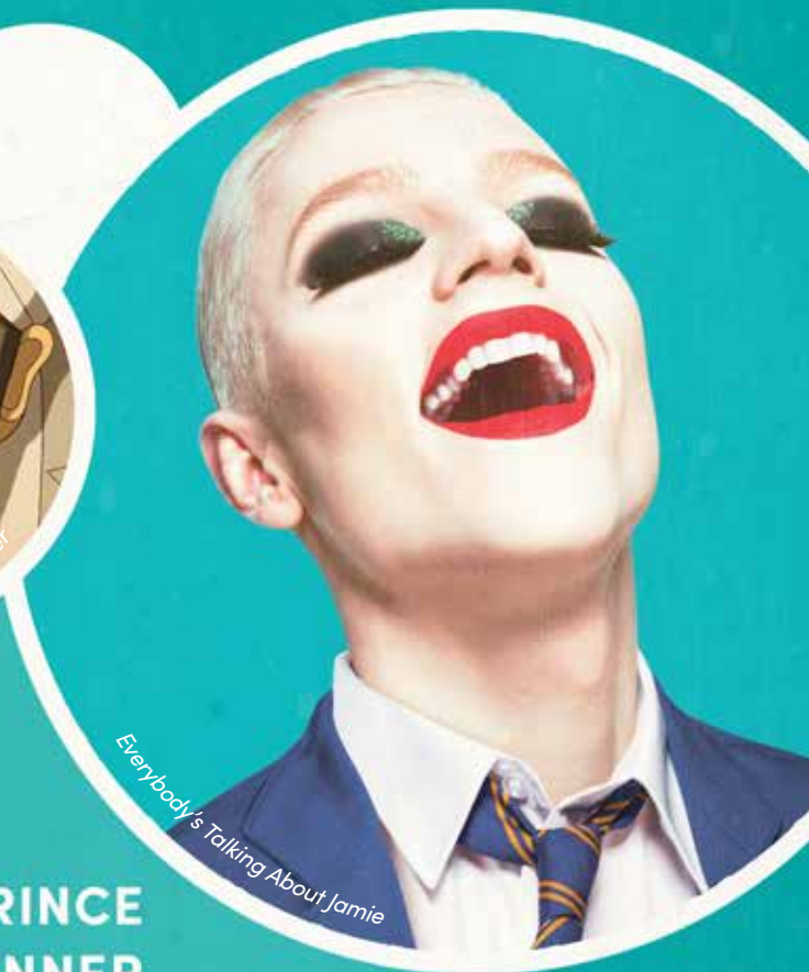
Everybody's Talking About Jamie

HIGHLIGHTS: THE HAPPY PRINCE THE BREADWINNER MARY SHELLEY LEAVE NO TRACE MAMMA MIA: HERE WE GO AGAIN!